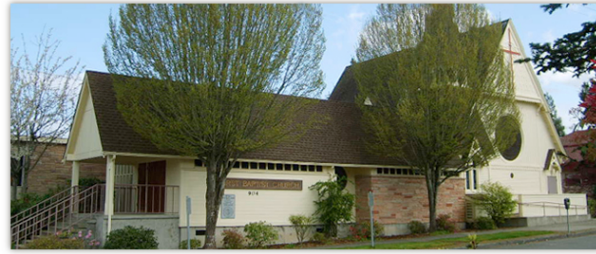
Table Grace @ First Baptist Church

Coming in to the Center to talk, a former client hears the Gospel and accepts Christ! Thanks to all who pray, serve, and give so that this can happen!!!